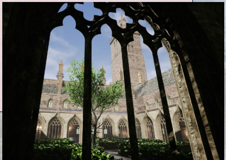
Digital recreation of St Salvator's Chapel

This summer will see a major exhibition on medieval St Andrews at the university's newly reopened Wardlaw Museum. With items loaned from across the UK, the exhibition highlights the importance of St Andrews in the centuries before the Reformation – a period when it was regarded as ‘the lady and mistress of the whole kingdom’. The splendour of the medieval burgh is recaptured through surviving objects (including sculptures, jewellery, ceramics, and manuscripts), and digital reconstructions of historic sites. Several objects will be on loan from collaborating partners. The exhibition is rooted in recent research undertaken within the Institute for Scottish Historical Research (in particular Michael Brown and Katie Stevenson’s Medieval St Andrews and Bess Rhodes’ Riches and Reform ). The exhibition runs from June to late September and will be accompanied by a series of public lectures and community events.